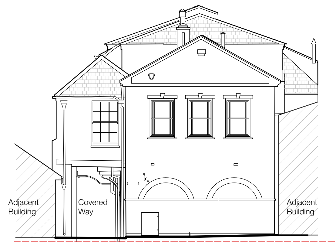
Existing Rear Elevation Scale: 1:100