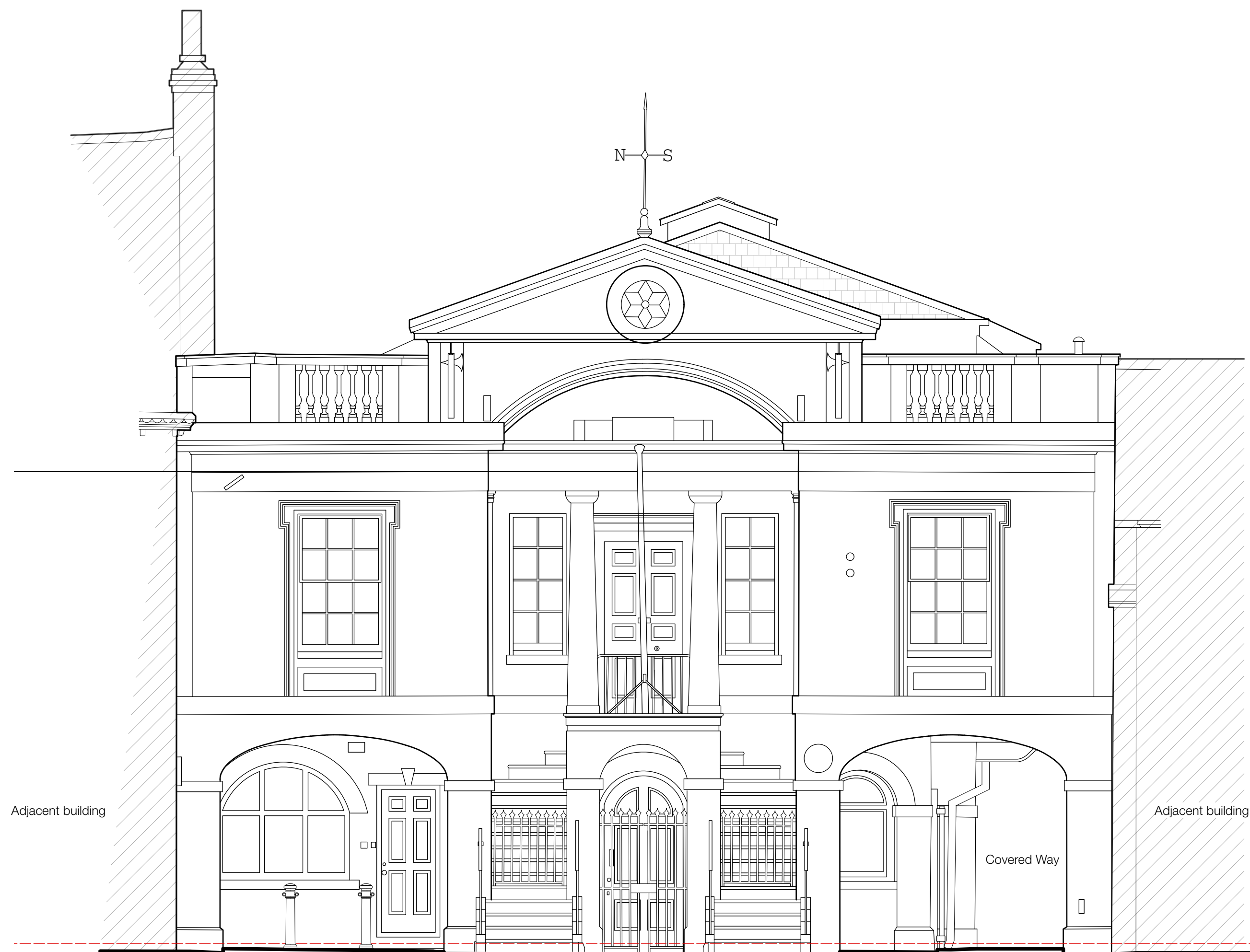
Existing Front Elevation Scale: 1:50