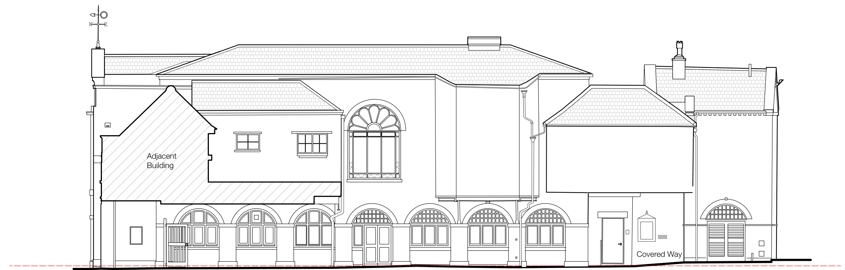
Existing South Elevation Scale: 1:100