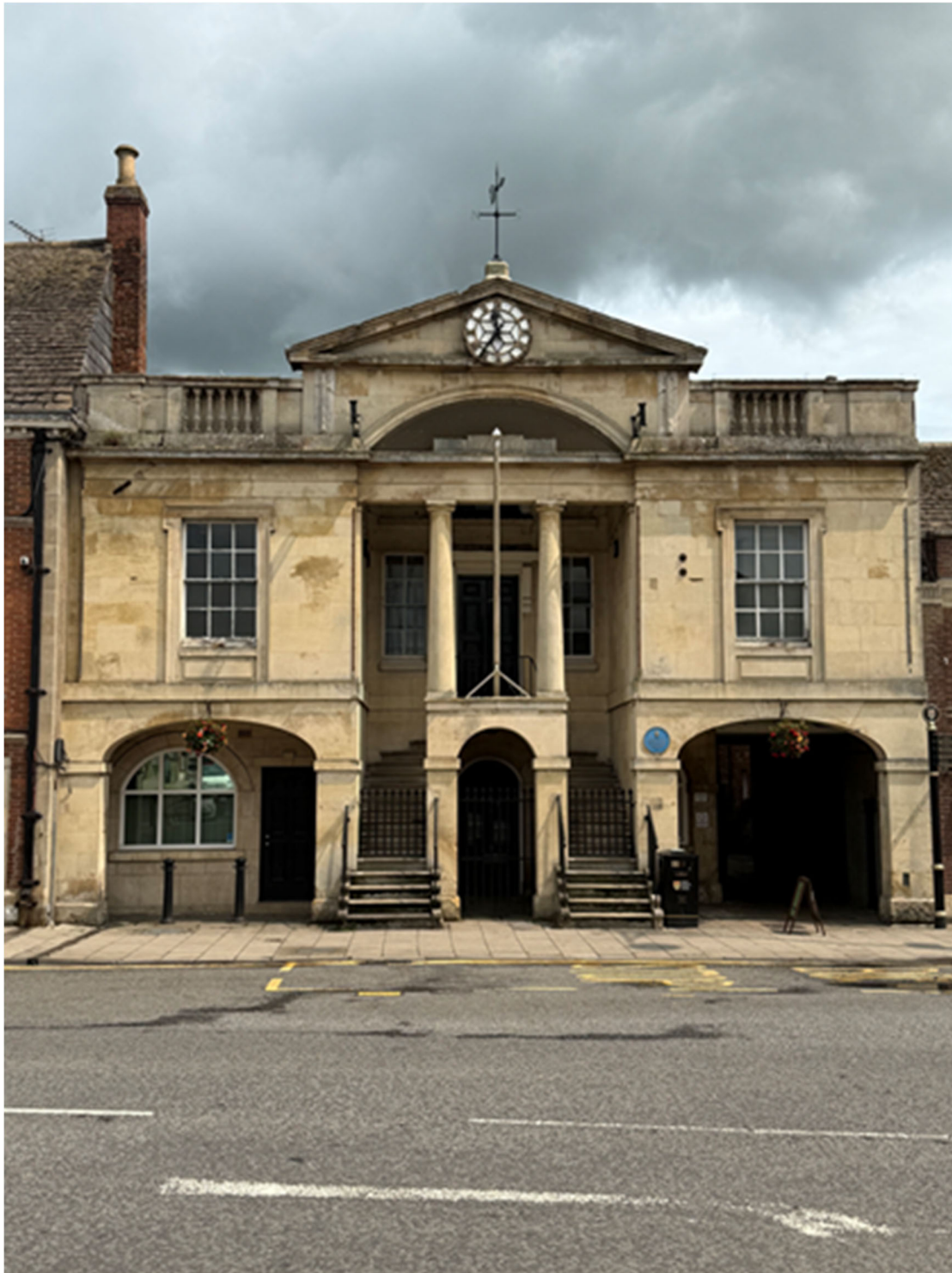
Figure 1 - Photograph of Bourne Town Hall from the front (2025).