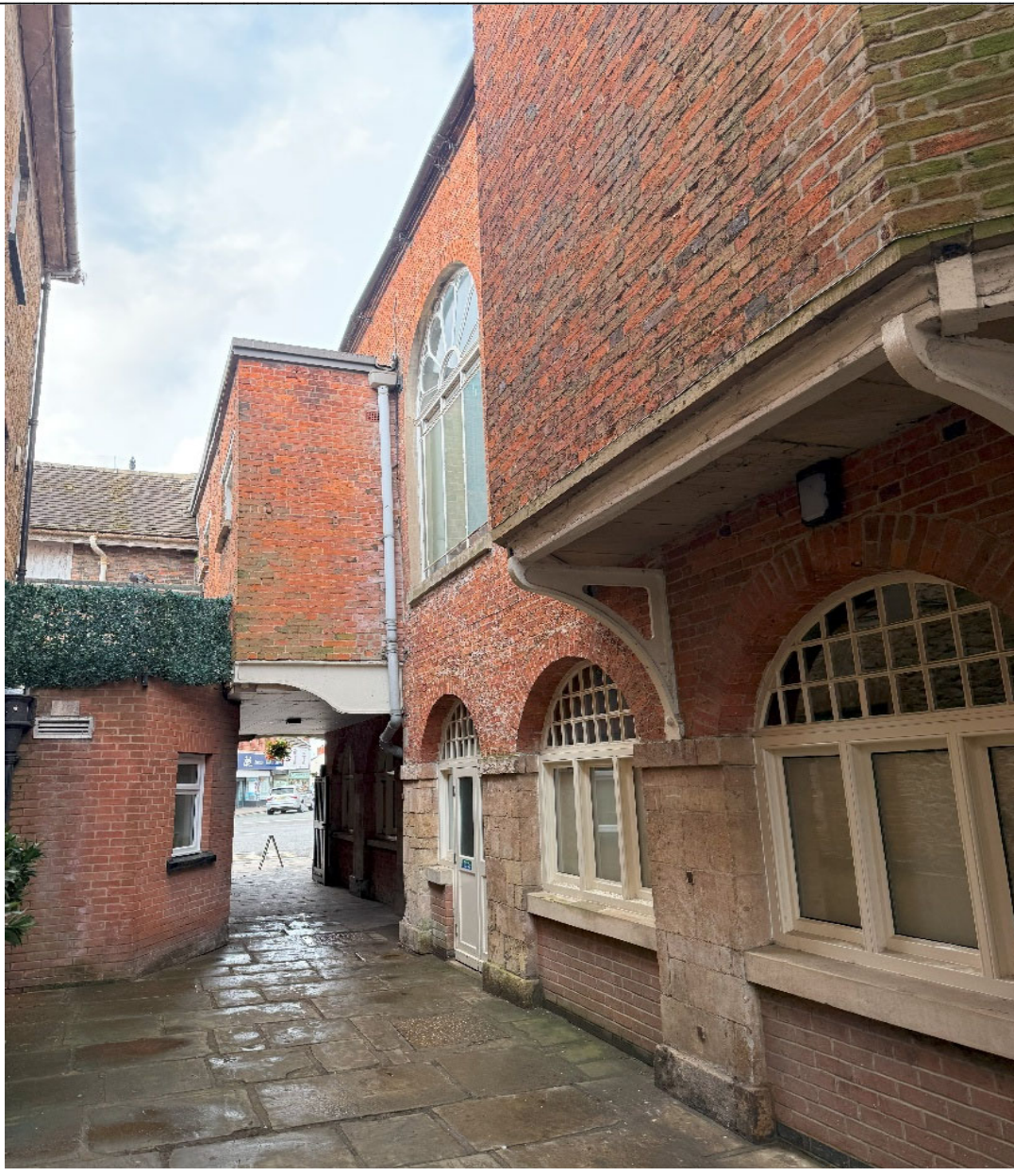
The side alley of the building