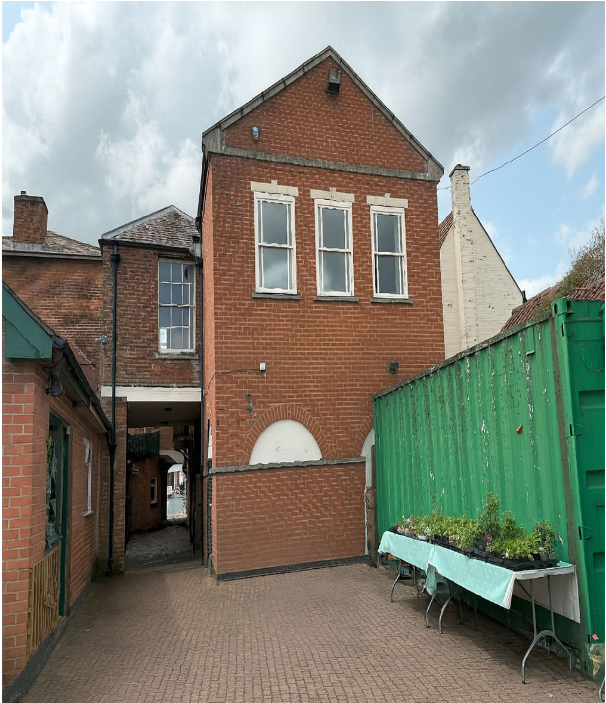
The rear view of the building